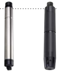
FDO® 700 IQ, FDO® 701 IQ